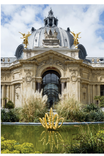
Jean-Michel Othoniel, Gold Lotus, 2019