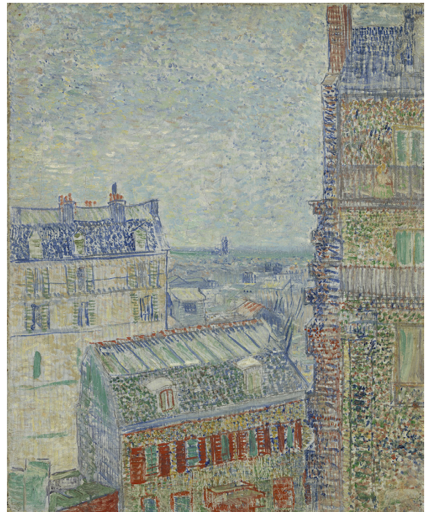
Vincent van Gogh, View from Theo's Apartment, 1887, oil on canvas. Amsterdam, Van Gogh Museum (Vincent Van Gogh Foundation)

The chronological exhibition layout follows the connections – influences, interaction, mutual enrichment – that sprang up between French artists and nine of their Dutch counterparts: Gérard van Spaendonck for the late 18th century and Ary Scheffer for the Romantic generation; Jacob Maris , Johan Jongkind and Frederik Kaemmerer for the mid-19th century; and George Breitner , Vincent van Gogh , Kees van Dongen and Piet Mondrian for the late 19th and early 20th centuries. Comparisons and similarities emerge as their works rub shoulders with those of French contemporaries including Géricault , David , Corot , Millet , Boudin , Monet , Cézanne , Signac , Braque and Picasso .